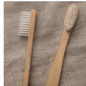
ECO-FRIENDLY HOME PRODUCTS