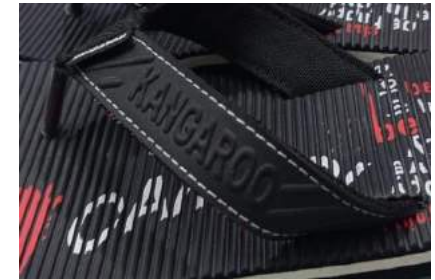
Embossed logo on strap