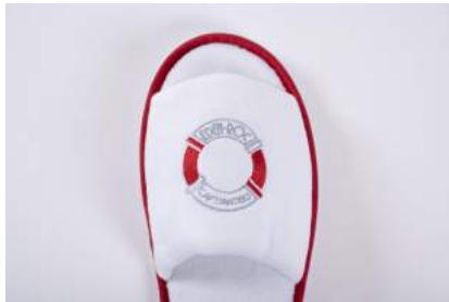
5cm2 embroidery on vamp