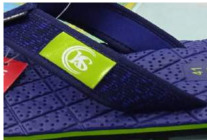
Printed Label on strap