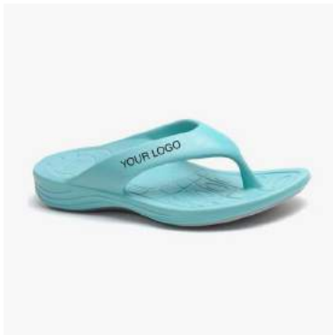
Thermoformed flip-flop made from 85% bio-sourced ethylene, ultra light & environmentally friendly