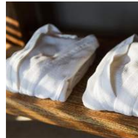
ECO-FRIENDLY BATHROBES AND TOWELS