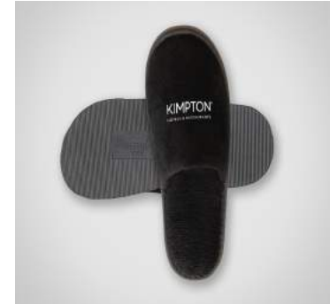
Velvet slipper with 5mm black bio-sourced sole