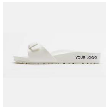
White EVA sandal "I'm green™" injection molded and 85% bio-sourced