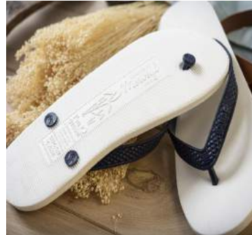
8mm flip-flops with recycled plastic straps