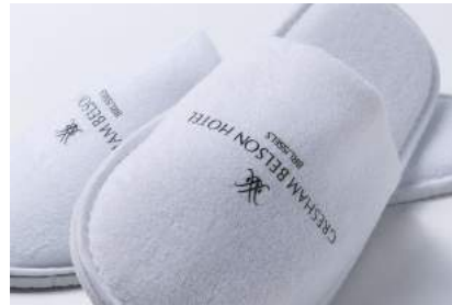
Thermal transfer printing on vamp