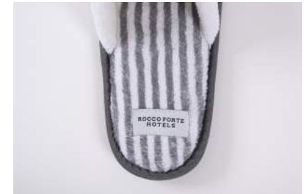
Label sewn on heel