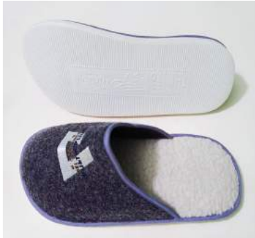
Winter slipper with 10mm bio-sourced sole