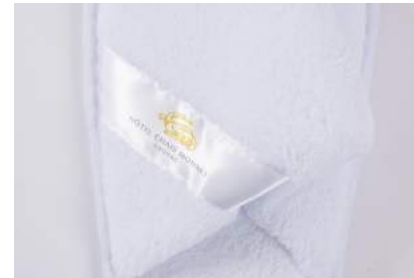
Label sewn on vamp