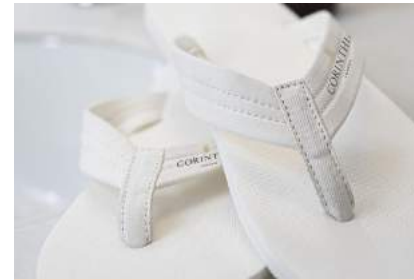
Embroidery on strap