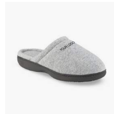
Reusable ecological slipper composed of a thermoformed "I'm green™" sole and a velvet upper. Cotton fiber padding.