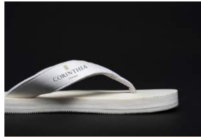
Offset printing on strap