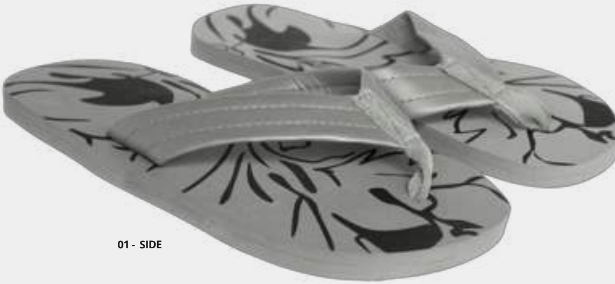
01 - SIDE

fully produced with a "I'm green™" polyethylene. You can compose your own design & create a unique customization. Thickness of soles begins with 8mm up to 20mm.