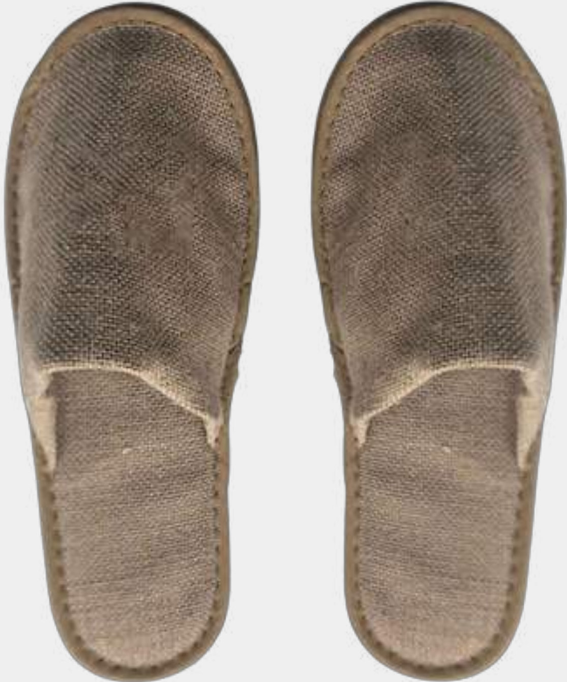
01 - NATURAL JUTE CLOTH

with a sole "I'm green™" of 5mm. Jute cloth comes in different colors. The vamp can be open or closed. Inner foam is produced with fiber cotton to provide an 85% bio-based slipper.