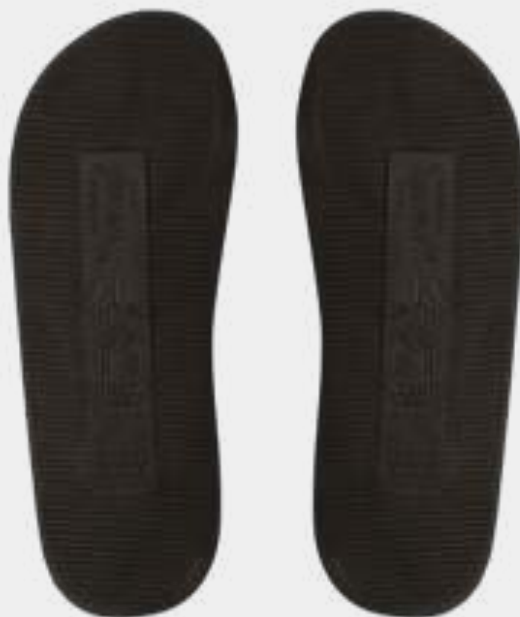
02 - I'M GREEN™ SOLE 18MM BLACK COLOR