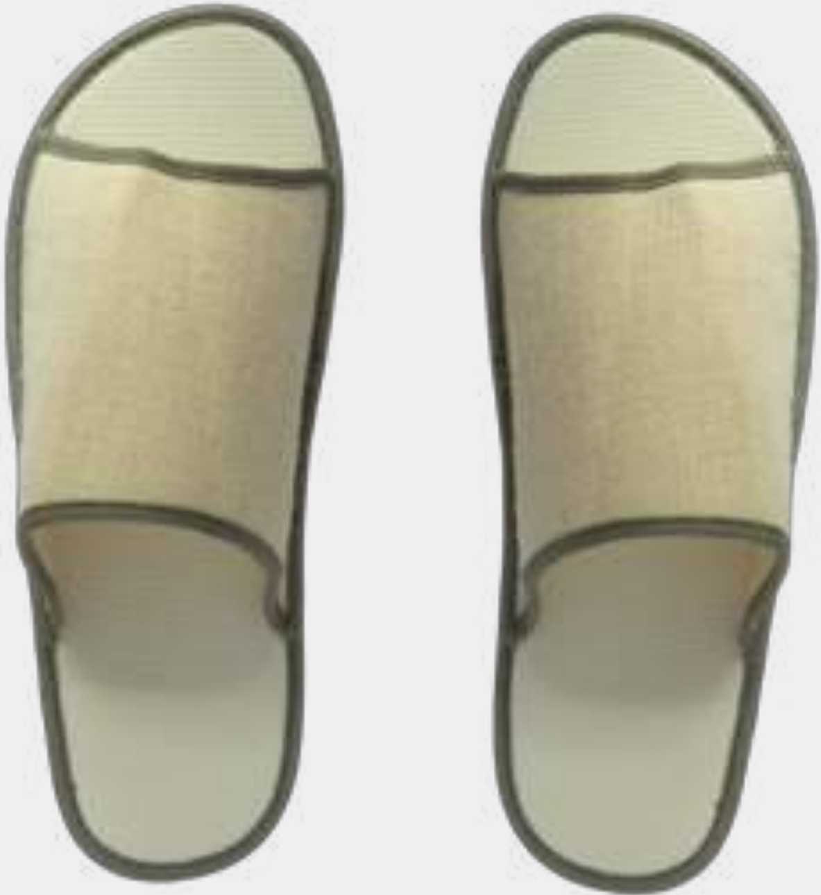
02 - WHITE JUTE CLOTH