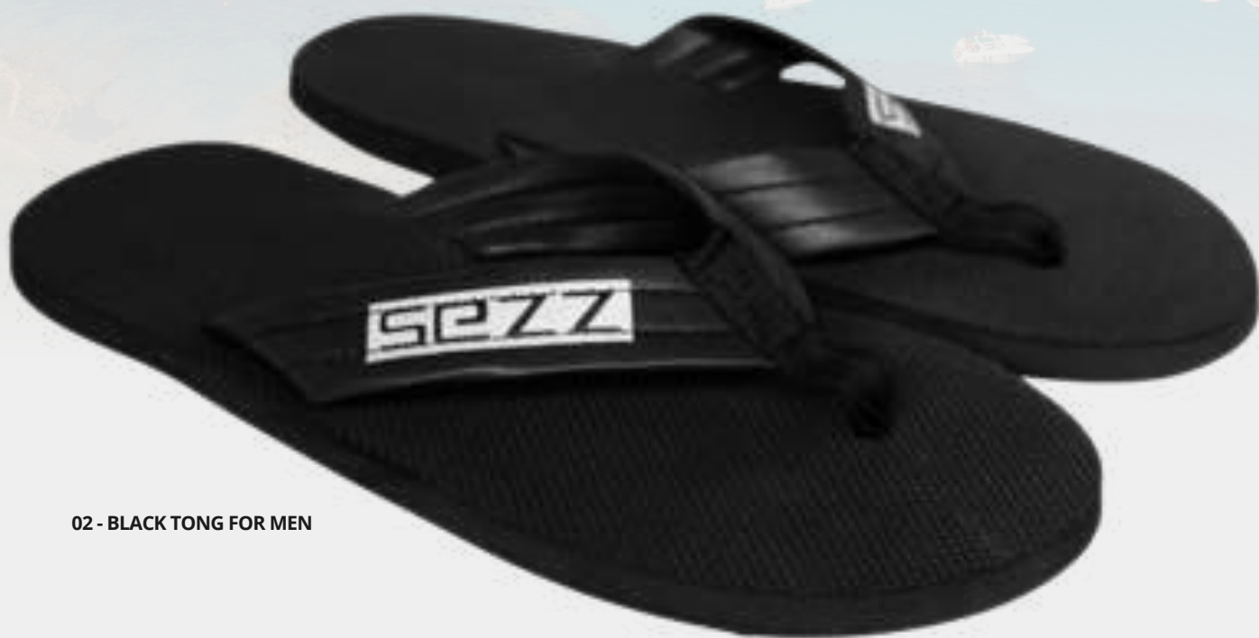
02 - BLACK TONG FOR MEN