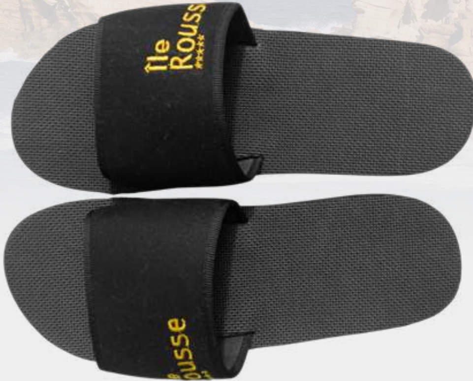
01 - SANDAL WITH LARGE VAMP OF 7CM

Perfectly suited for both the bedroom and Spa, our black sandal is manufactured with a biobased sole "I'm green™". With a thickness of 18mm, this model can be single used or reused after cleaning. The vamp is made-up of a 3mm "I'm green™" layer covered with a black cotton knitwear. The logo can be printed or embroidered.