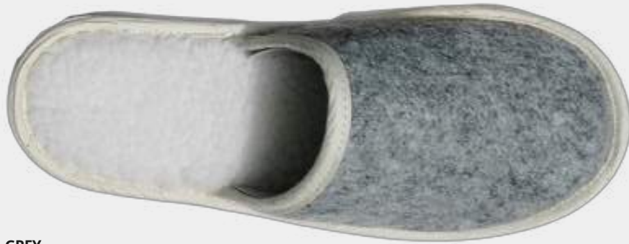
01 - GREY