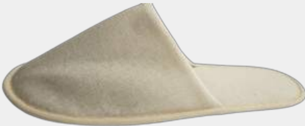
02 - SIDE