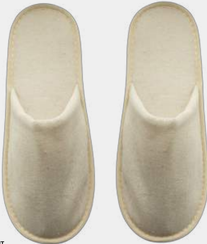
01 - FRONT

fabric with a cotton piping tone-on-tone and a 3mm "I'm green™" polyethylene.