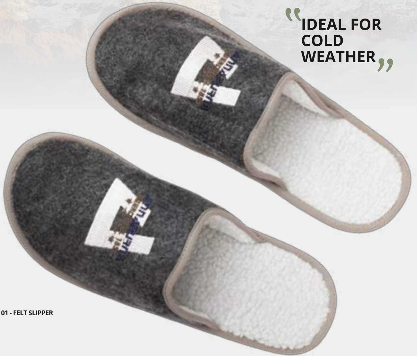
01 - FELT SLIPPER