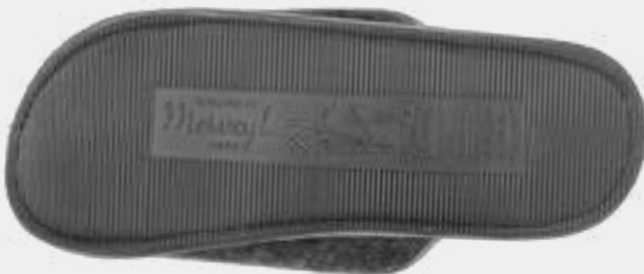
02 - BLACK SOLE