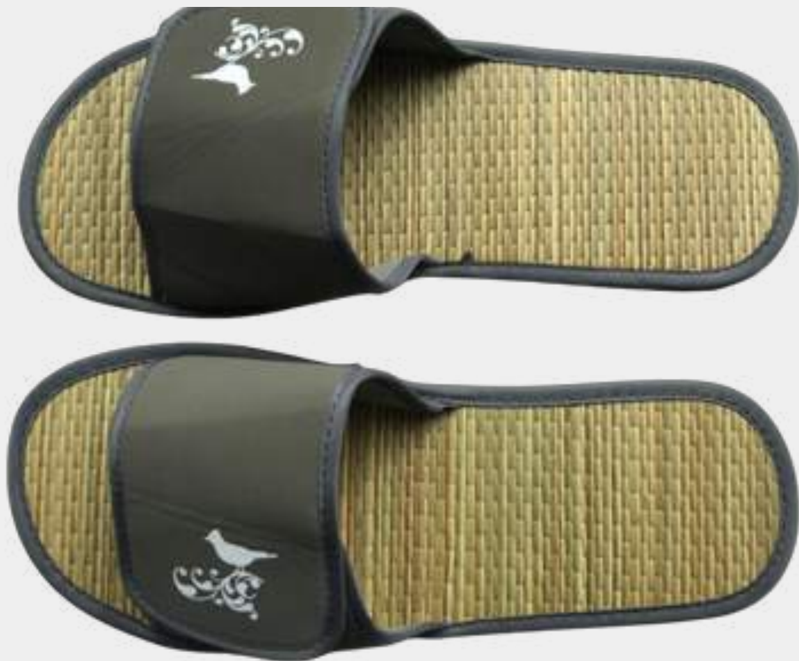
01 - STRAW SANDAL

With outstanding terraces and outside pools, the hotel selected a straw sandal with a vamp that can be adjusted with a velcro fastening. This model will be improved with an 8mm "I'm green™" sole.