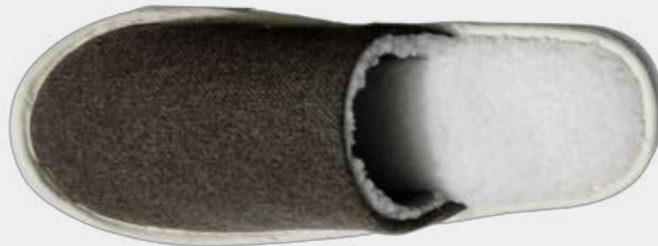
02 - BROWN