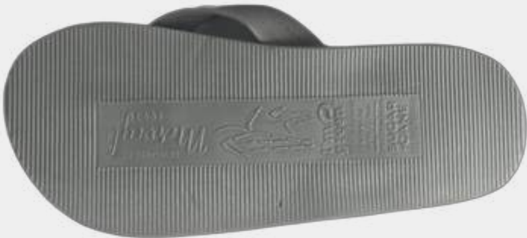
02 - BACK