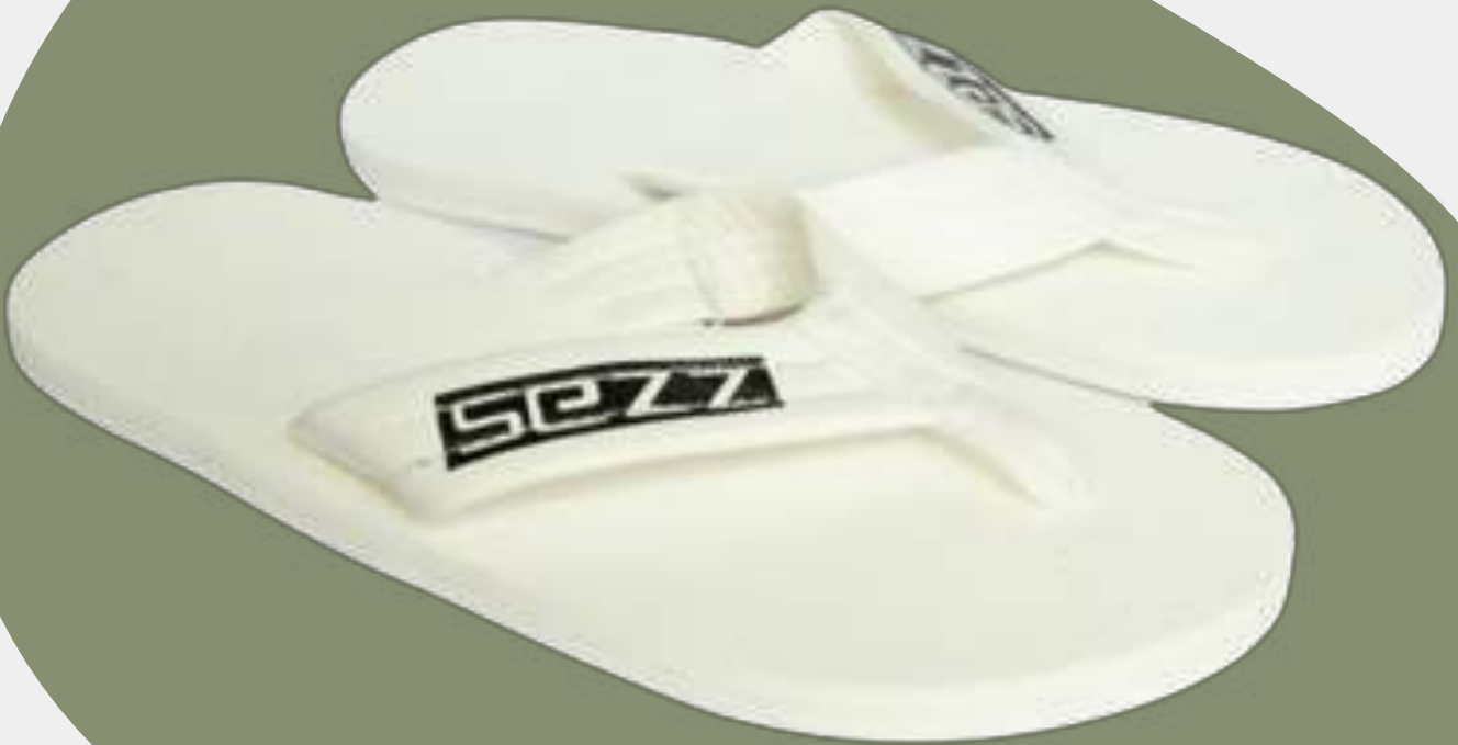
01 - WHITE TONG FOR LADIES

Hotel Sezz in Saint Tropez is an ecofriendly Luxury hotel. The team was seduced by the low emission of Co2 for the production of their new 8mm single-used flip-flops. Two different colors were chosen for sizes. Plastic straps have been replaced by a 3cm width "I'm green™" straps which makes it very comfortable.